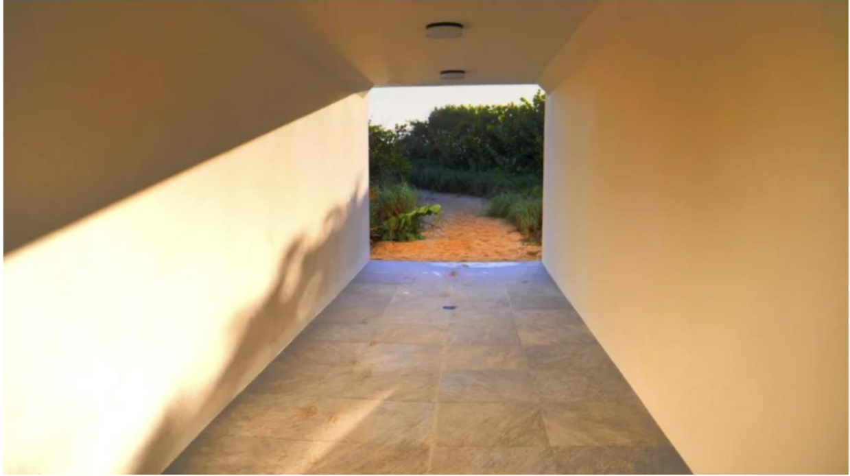
The tunnel.