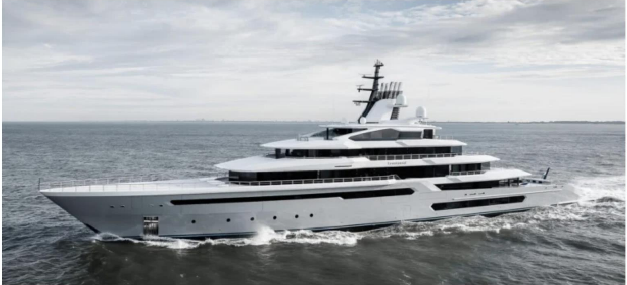
The 364 feet long Leviathan

Well, not entirely, as the 2.06-acre property, originally listed for $85 million, spans from the ocean to the Intracoastal Waterway, with a tunnel connecting the house to the ocean, shared The Wall Street Journal. So he is still very much connected to the water, but will now find some solid grounding in the massive 20,000-square-foot residence.